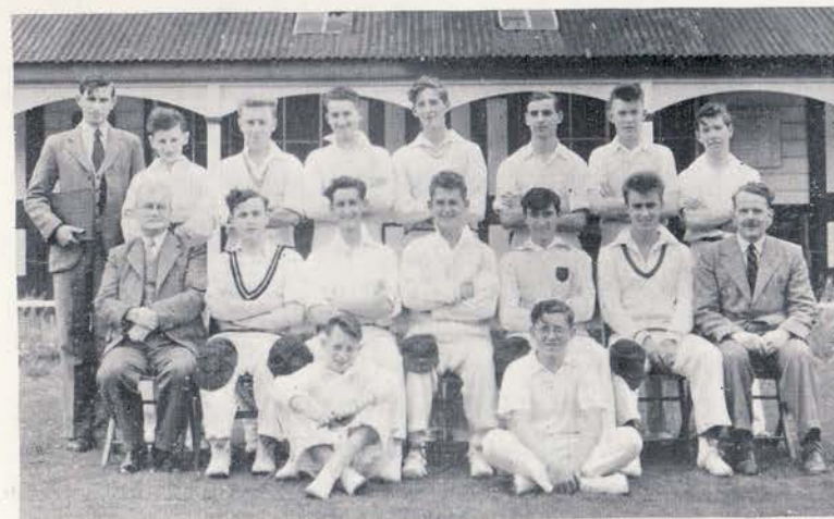
CRICKET TEAM 1953.

Patronised by Welsh Folk Museum, St. Fagan's,