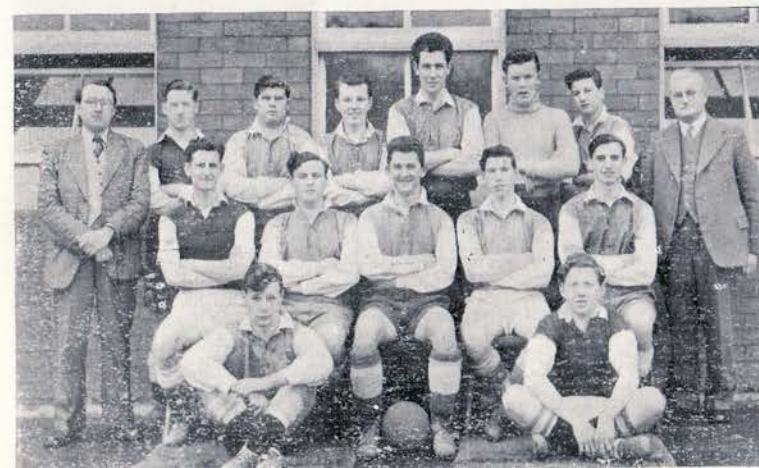
1st XI. 1953—1954.